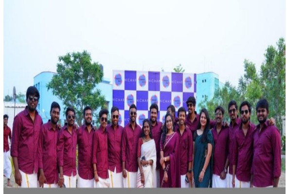
INNERVE the annual cultural fest of NICMAR Hyderabad, was celebrated over a two-day period during which the student got an opportunity to connect and network with each other and also display their talents. This year, it was organized on 12<sup>th</sup> and 13<sup>th</sup> of March. The events witnessed enthusiastic participation culminating with a talent show and a musical night by the students.