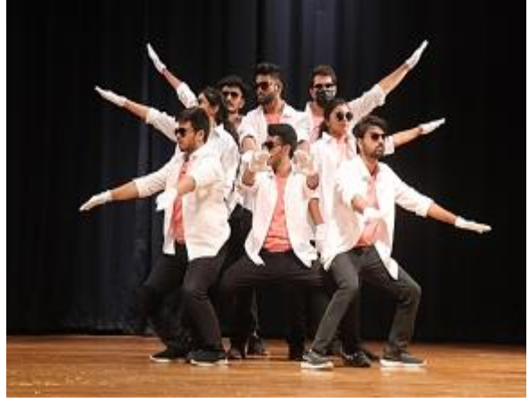
SPIRIT & INNERVE 2022 @Hyderabad