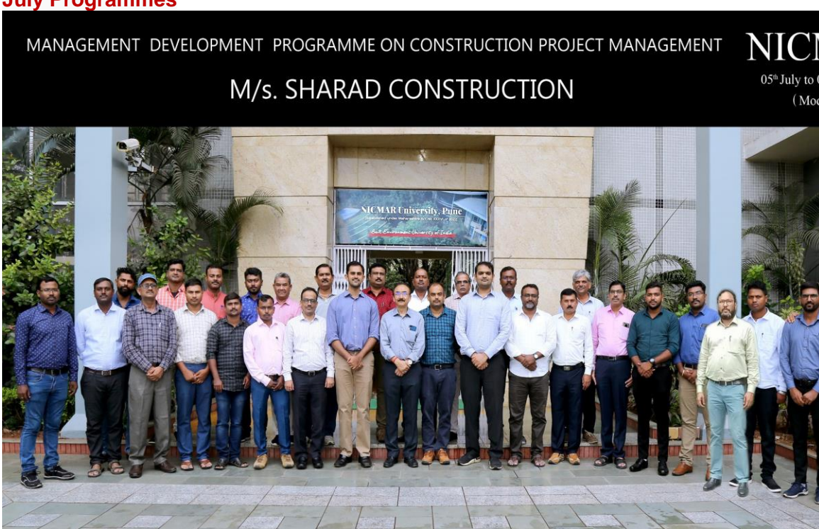
Management Development Programme (MDP) for Sharad Construction, was conducted on 'Construction Project Management' comprising of 30 participants