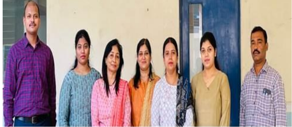
Head Admissions - Hyderabad