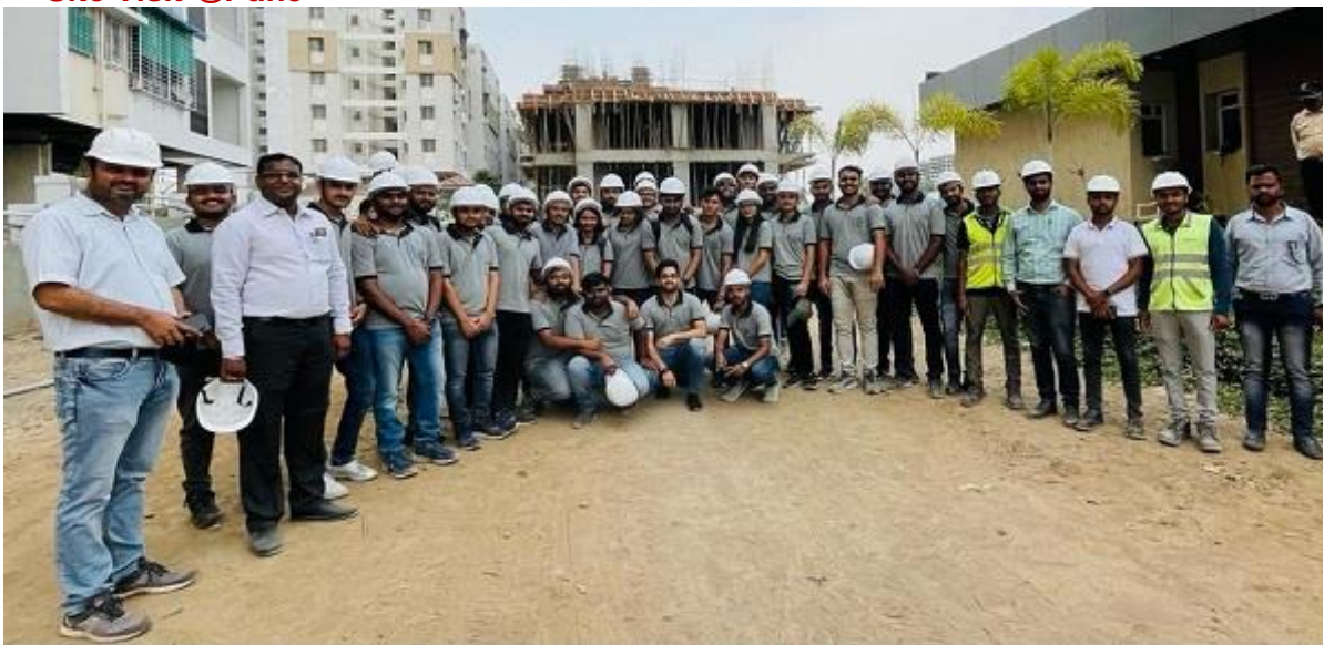
Site visit was arranged for the students of Junior batch of Advanced Construction Management program at Jhamtani Realty Private Limited for their ACE Aurum Project, Ravet and Fidesto Projects in Pune. Students got insights of the latest construction methods and techniques on the projects.