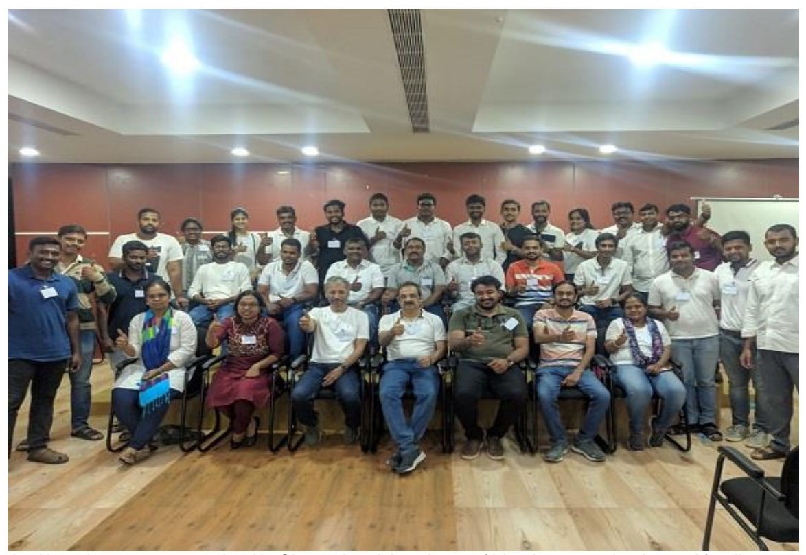
An Alumni meet was organised in Chennai and the winner of Ideathon 2.0 raised crowd funding for his venture at this meet.