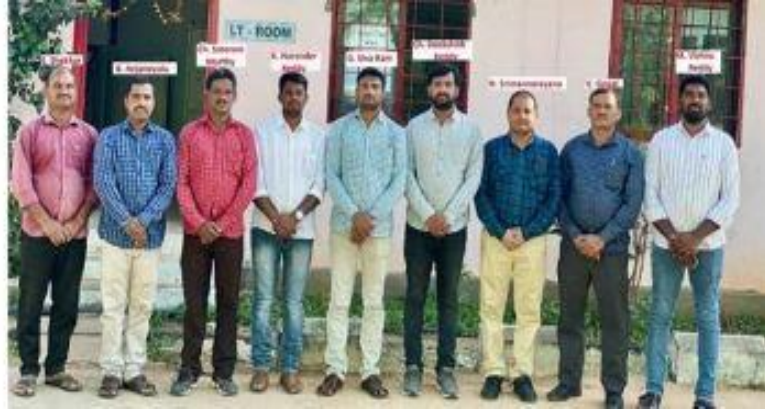
Admin and Service Team

The dedicated and tireless efforts of all the members of the Maintenance & Project team and Admin & Services Team makes them the Team of the Month. Congratulations!!!